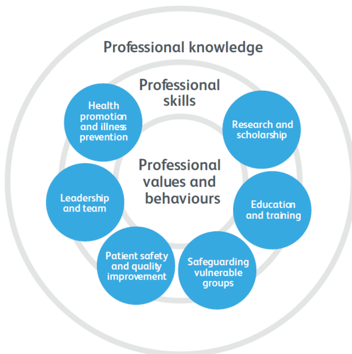
The nine domains of the GMC's Generic Professional Capabilities

The GMC has developed the Generic professional capabilities (GPC) framework with the Academy of Medical Royal Colleges (AoMRC) to describe the fundamental, career-long, generic capabilities required of every doctor. The framework describes the requirement to develop and maintain key professional values and behaviours, knowledge, and skills, using a common language. GPCs also represent a system-wide, regulatory response to the most common contemporary concerns about patient safety and fitness to practise within the medical profession. The framework will be relevant at all stages of medical education, training and practice.