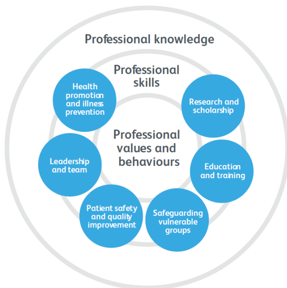
The nine domains of the GMC's Generic Professional Capabilities

The GMC has developed the Generic professional capabilities (GPC) framework 2 with the Academy of Medical Royal Colleges (AoMRC) to describe the fundamental, career-long, generic capabilities required of every doctor. The framework describes the requirement to develop and maintain key professional values and behaviours, knowledge, and skills, using a common language. GPCs also represent a system-wide, regulatory response to the most common contemporary concerns about patient safety and fitness to practise within the medical profession. The framework will be relevant at all stages of medical education, training and practice.