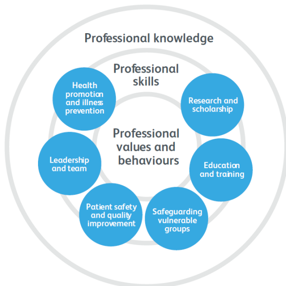
The nine domains of the GMC's Generic Professional Capabilities

Good medical practice (GMP) 3 is embedded at the heart of the GPC framework. In describing the principles, duties and responsibilities of doctors the GPC framework articulates GMP as a series of achievable educational outcomes to enable curriculum design and assessment.