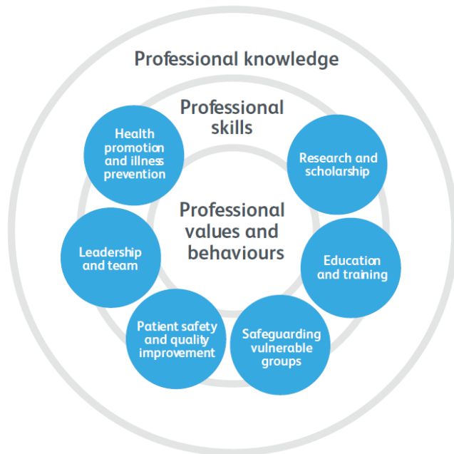
The nine domains of the GMC's Generic Professional Capabilities

Good medical practice (GMP) 2 is embedded at the heart of the GPC framework. In describing the principles, duties and responsibilities of doctors the GPC framework articulates GMP as a series of achievable educational outcomes to enable curriculum design and assessment.