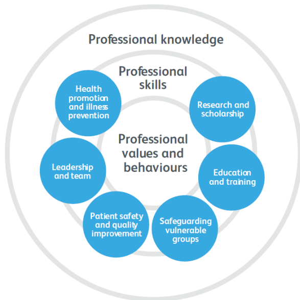
The nine domains of the GMC's Generic Professional Capabilities

The nine domains and subsections of the GPC framework are directly identifiable in the curriculum. They are mapped to each of the generic and specialty CiPs, which are in turn mapped to the assessment blueprints. This is to emphasise those core professional capabilities that are essential to safe clinical practice and that they must be demonstrated at every stage of training as part of the holistic development of responsible professionals.