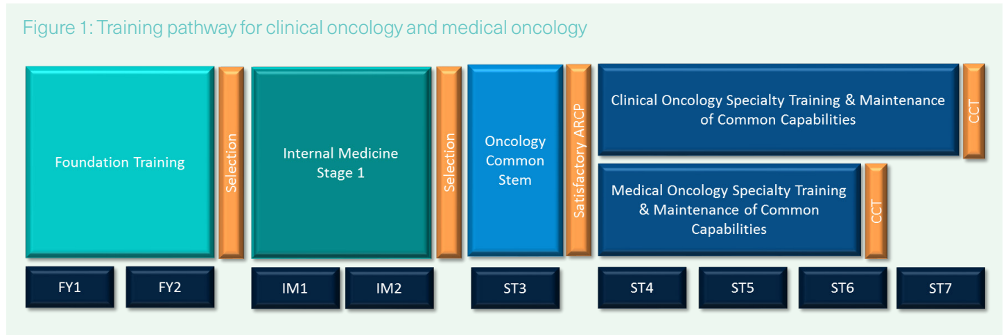
Figure 1: Training pathway for clinical oncology and medical oncology

Clinical oncology trainees are required to enrol with the RCR and become trainee members of the RCR prior to the commencement of their training. Trainees are required to maintain RCR membership, including the full payment of all applicable fees, throughout training for the RCR to be able to recommend them as eligible for award of a certificate of completion of training (CCT).