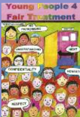
Inderjit Mehroke, England